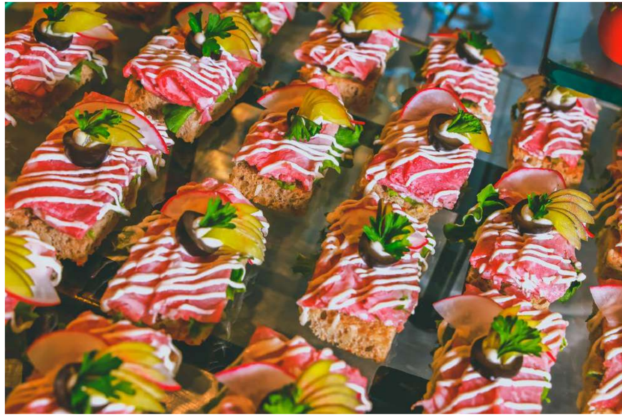
COLD - CHOOSE 4

Receptions are 1 hour with the option to extend in ½ hour increments a la carte; Weddings are 1 hour and 30 minutes on embarkation day; All extended receptions purchased a la carte are subject to venue availability.