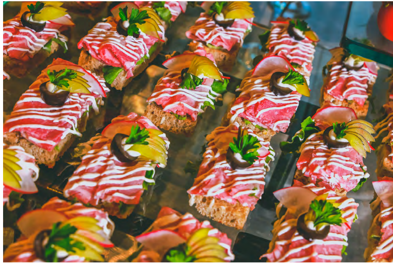
COLD - CHOOSE 4

Receptions are 1 hour with the option to extend in ½ hour increments a la carte; Weddings are 1 hour and 30 minutes on embarkation day; All extended receptions purchased a la carte are subject to venue availability.