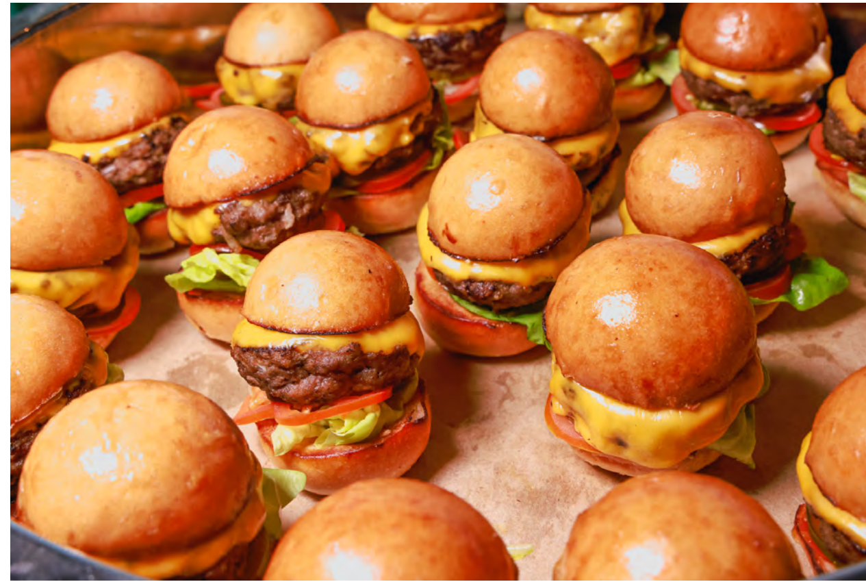
HOT - CHOOSE 4