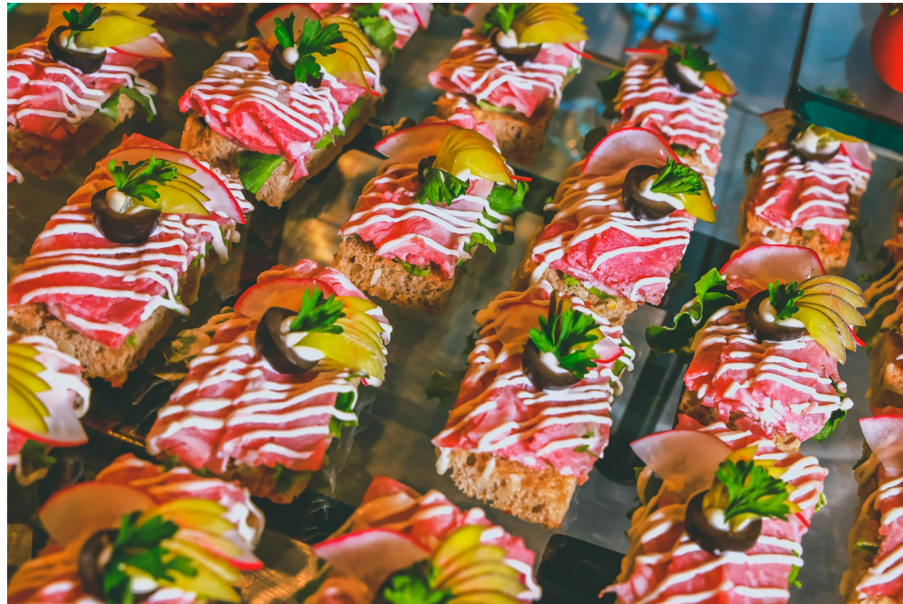
COLD - CHOOSE 4

Receptions are 1 hour with the option to extend in \frac{1}{2} hour increments a la carte; Weddings are 1 hour and 30 minutes on embarkation day; All extended receptions purchased a la carte are subject to venue availability.